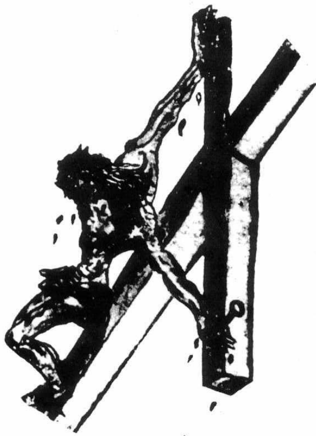
Illustration by St. John of the Cross of the Crucifixion